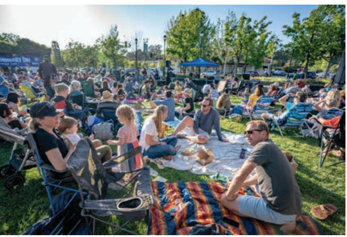
Many families enjoyed the Rock the Plaza event last week.

visit our website www.bayareadrainage.com